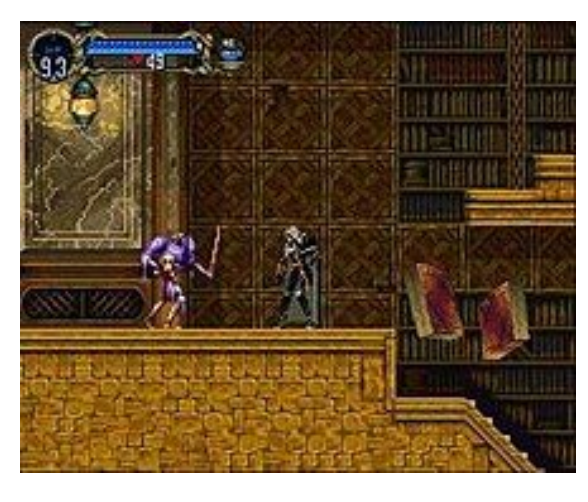
Castlevania: Symphony of the Night (PSX)