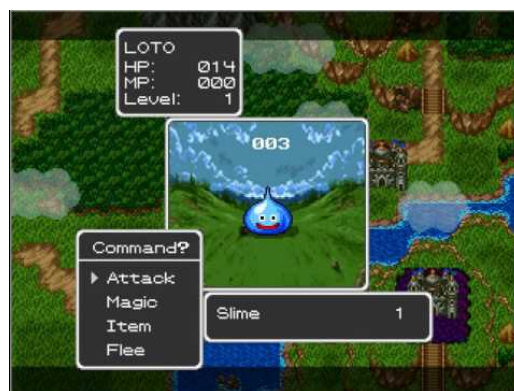
(Dragon Quest I)